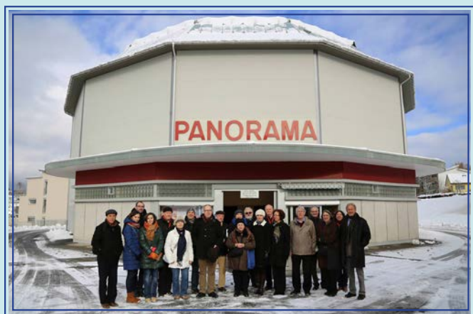
IPC Conference Trip, Einsiedeln, Switzerland, 2013

We welcome all who are interested in the heritage of panoramas, create or show panoramas, both historic and contemporary, or have a general interest in immersive media. We are proud to have a varied member base that includes architects, artists, collectors, conservators, curators, historians, art historians, librarians, museum directors and staff, 360° photographers, researchers, scientists, spatial designers, tourism developers, and virtual and augmented reality specialists.