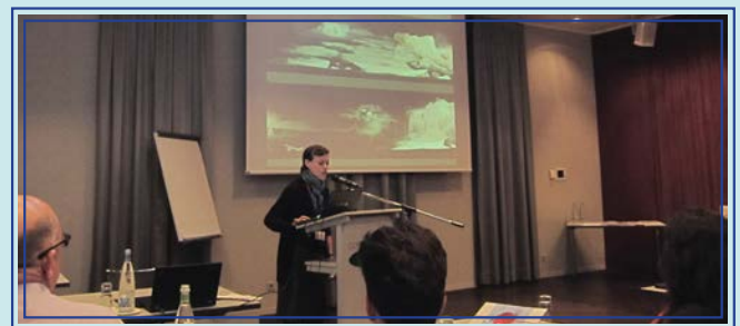
IPC Conference Room, Lucerne, Switzerland 2013

The purpose of the International Panorama Council is to stimulate worldwide research and communication about existing and future panoramas, advocate for and help preserve the few surviving heritage panoramas, and promote professional affiliation. IPC serves as a bridge connecting the heritage era of the panorama art form to its contemporary and future manifestations, and strives to facilitate the formal international recognition and protection of panoramas by organizations like UNESCO and the Council of Europe.