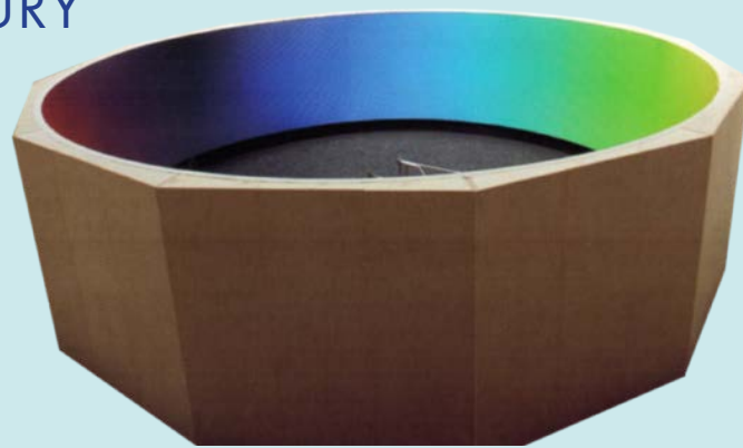
Cyclorama, Sanford Wurmfeld

In the United States, artist-driven projects, such as the Velaslavasay Panorama (Los Angeles) and the Crankie Factory (Seattle), embrace the historical components of the medium together with the artistic principles of the moving and immersive panoramas. In New York alone, media artists Michael Naimark and TJ Wilcox explore the representation of place through 360° projection, while Sanford Wurmfeld creates abstract hand-painted color-field cycloramas that play with the viewer’s perception.