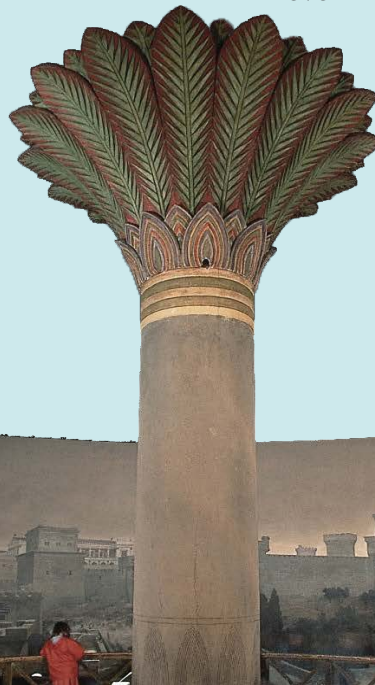
Altötting Panorama, Germany

By 1792, Barker's uninterrupted 360° view became known as a "panorama" (from the Greek "pan" (all) and "horama" (view)). A year later, his Panorama of London was exhibited in its own purpose-built "rotunda," in Leicester Square. Mixing high art, engineering, and popular appeal, the panorama manipulated perspective unlike any other art form and provided a comprehensive view from a focal height—a spectacle that visitors paid good money for. As more panoramas opened up—each attempting to better capture a sprawling urban landscape, a scene of nature, a military battle, or a religious event—painted by other artists and exhibited in other locations, the panorama transformed from an uncertain investment into a successful enterprise; from a curiosity into a phenomenon. Soon related art forms appeared: dioramas, cycloramas, moving panoramas, pan-stereoramas. Today, there are more than twenty historical panoramas of the heritage era worldwide.