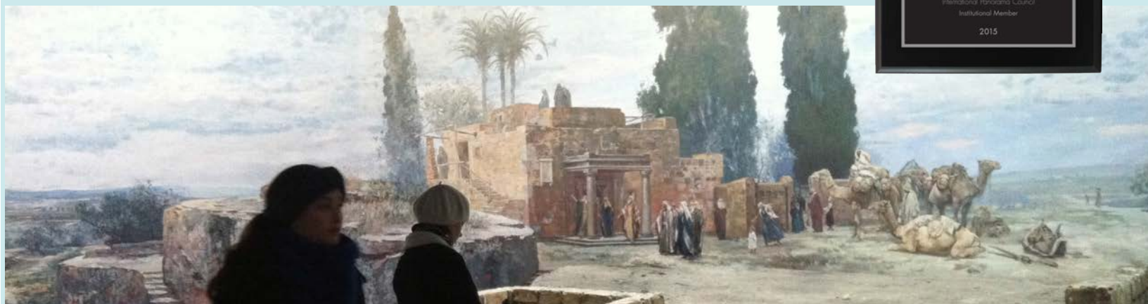
The Crucifixion of Christ Panorama, Einsiedeln, Switzerland