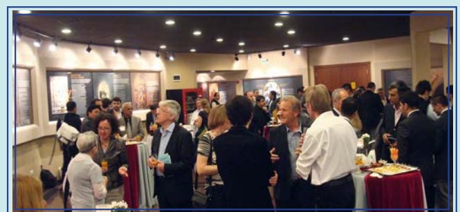
IPC Conference Reception, Istanbul, Turkey, 2010