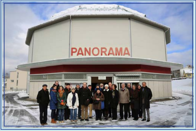
IPC Conference Trip, Einsiedeln, Switzerland, 2013

IPC thrives due to its enthusiastic group of members, who support the platform of the organization and its goal to discuss, advise, and advance professional networks. Members receive regular panorama announcements through our website, social media, and quarterly newsletter, as well as international exposure, marketing strategies, and support for their work.