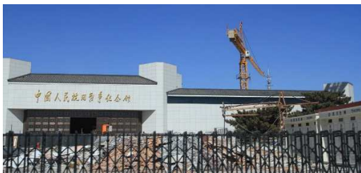
Museum facade under construction