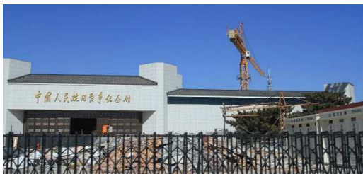
Museum facade under construction