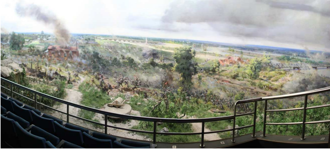
Installation view of the "Lugouqiao Incident" 180-degree panorama as of March 2015