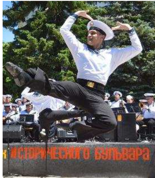
picture from the website of the Sevastopol panorama celebration

http://www.sev-museum-panorama.com/ru/index.html