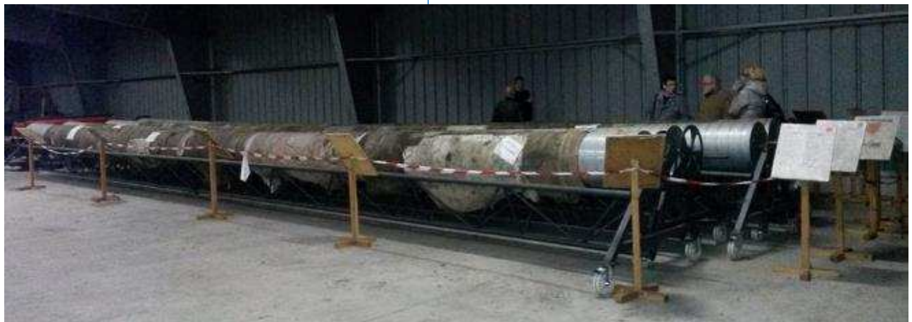
Panorama scrolls in Namur.

http://panoramacouncil.org/what_we_do/international_panorama_conferences/upcoming_conference/registration/